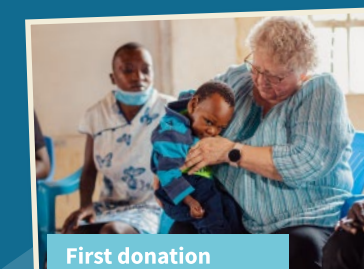
First donation to LLH Foundation

Seeing the need to help the families on LLH's evergrowing Waiting List, LLH launches their new, Early Intervention program.