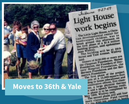
Moves to 36th & Yale

LLH Tulsa expands into their brand new 60,000 sq ft facility at 36th & Yale.