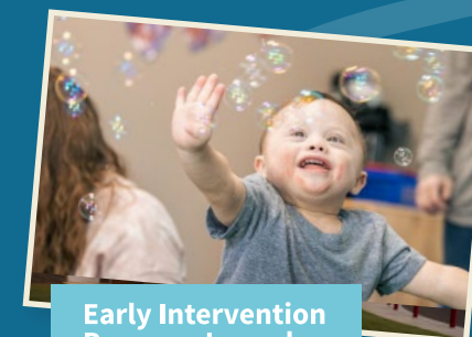
Early Intervention Program Launch

Little Light House teaches their first international intern from China.