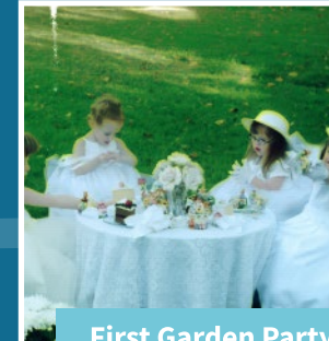
First Garden Party

Little Light House becomes accredited by the International Christian Accrediting Association for the first time.