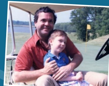
First Links for Little Ones

LLH classrooms start overflowing and the Waiting List is established for families waiting to attend our Developmental Center.