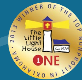
Awarded the ONE Award

Little Light House finishes their extensive Bible Based Curriculum to be given away for free to anyone who needs it.