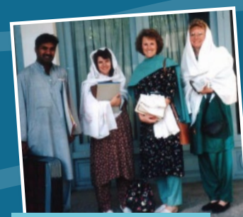
First Global Outreach

Little Light House outgrows their location and moves to 36th & Yale.