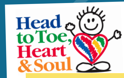
Bible Based Curriculum Finished

Tulsa golfers come together at Little Light House's first golf tournament, Links for Little Ones.