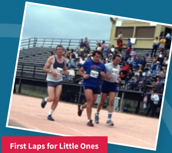
First Laps for Little Ones

Out of frustration with the lack of services for children with special needs, Marcia Mitchell and Sheryl Poole open the Little Light House.