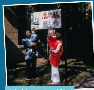
Little Light House is Established

From two mothers trying to do their best for their children to a leader in Early Intervention, Little Light House has changed lives not only in Tulsa but worldwide, thanks to our community's constant support.