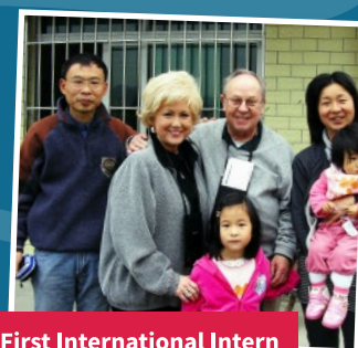
First International Intern

Little Light House has their first global outreach in Pakistan.