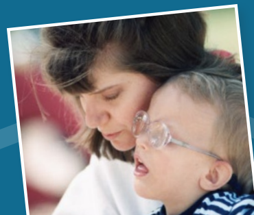
Waiting List Established

LLH hosts their first Mini-Laps, a fundraiser that celebrates the milestones our students have reached throughout the school year.