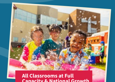
All Classrooms at Full Capacity & National Growth

Little Light House Foundation receives its first donation to help national and international expansion of LLH.